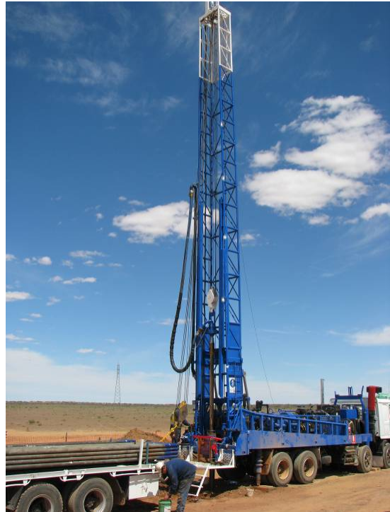
Figure 1: Torrens Energy drilling programme underway at Parachilna, north of Port Augusta in South Australia. High voltage electricity towers visible in the background.

With a dominant land position secured proximal to power infrastructure, excellent 'hot rock' exploration results and a solid cash position, as well as a strong and experienced development partner, Torrens Energy is in excellent shape to deliver shareholder value.